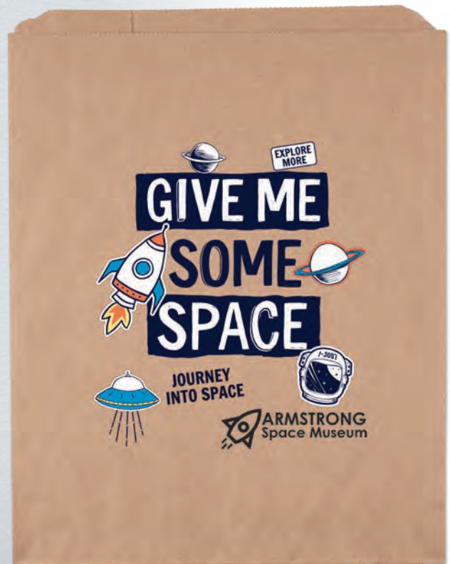
COLOR VISTA 11 X 13¾