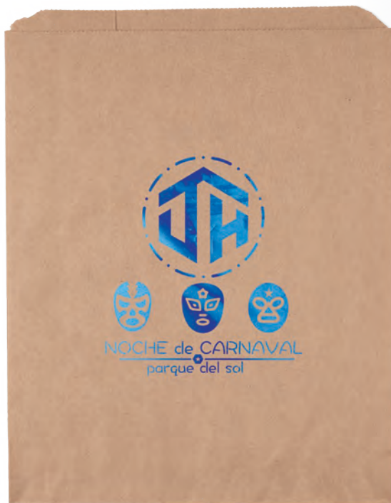
FOIL PRINT 11 X 13¾

Imprint Area: Front/Back - 7W x 8H (Dynamic Color) Front - 7W x 7H (Flexo Ink Print, ColorVista) Front - 6W x 6½H (Foil Print)