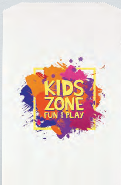
DYNAMIC COLOR 7 X 10