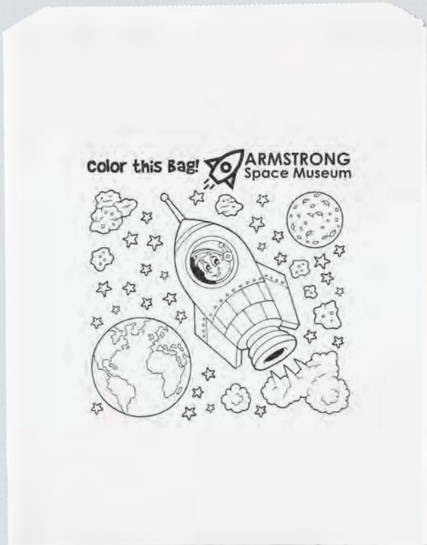
FLEXTM INK PRINT 11 X 13¾